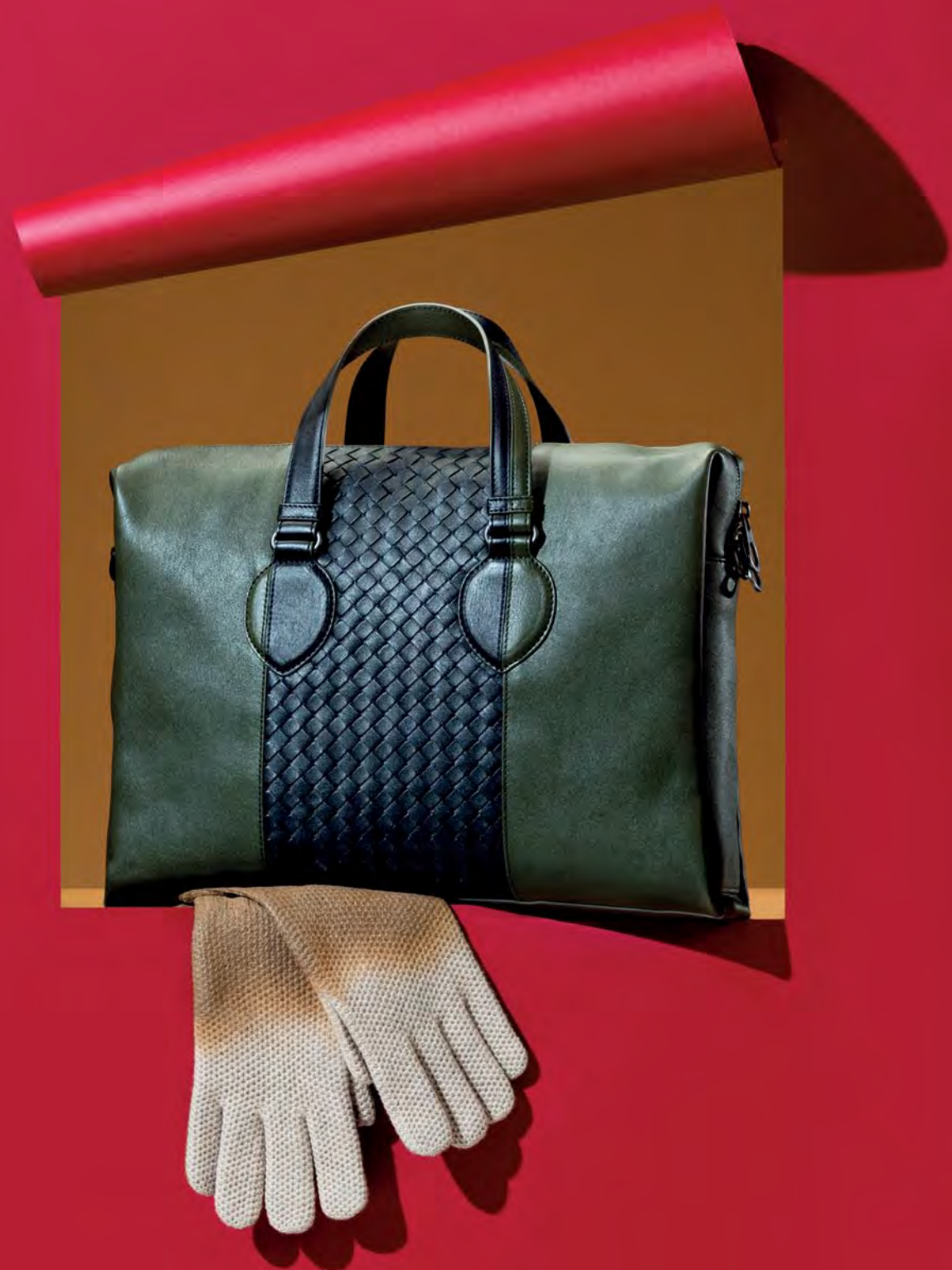
Opposite page 对页: BOTTEGA VENETA Dark Sergeant Nero nappa briefcase 织皮纳帕公事包 ERMEGILDO ZEGNA Couture cashmere and carpincho gloves 羊绒及水豚皮手套