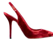
DOLCE & GABBANA Heels 高跟鞋

精巧的宝石镶嵌饰品及高贵的色调，都是教人轻易爱上 Dolce & Gabbana 冬季系列的主因。这个意大利品牌拥有传奇背景，在他们的演绎下，从包包、鞋子、首饰到衣服都是最佳的礼物之选。