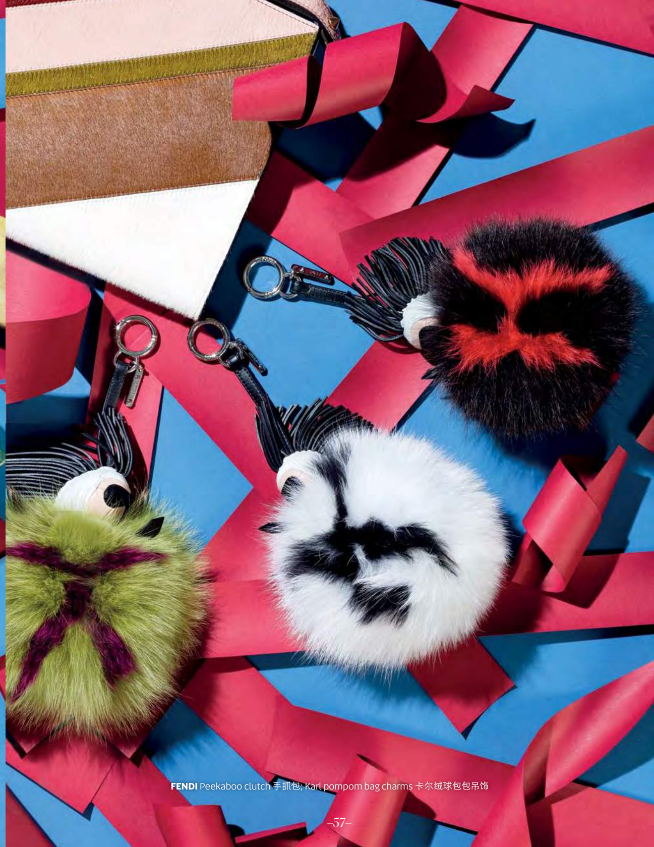
FENDI Peekaboo clutch 手抓包; Karl pom-pom bag charms 卡尔绒球包包吊饰