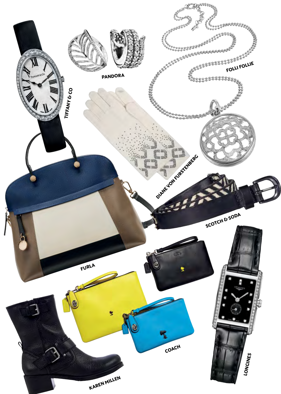
TIFFANY & CO