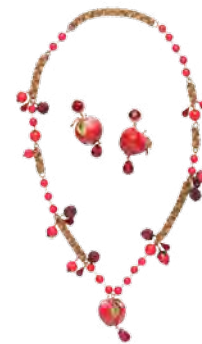
DOLCE & GABBANA Necklace and earrings 项链及耳环