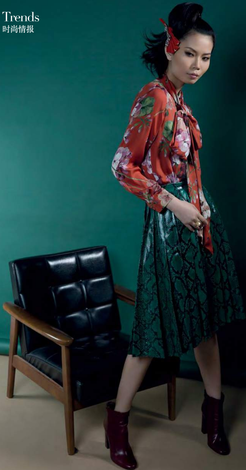
GUCCI Blouse 上衣 BALLY Jacket 外套 MIU MIU Skirt 半截裙 TORY BURCH Shoes 短靴 PRADA Brooch worn as hair clip 胸针 (作发夹用)