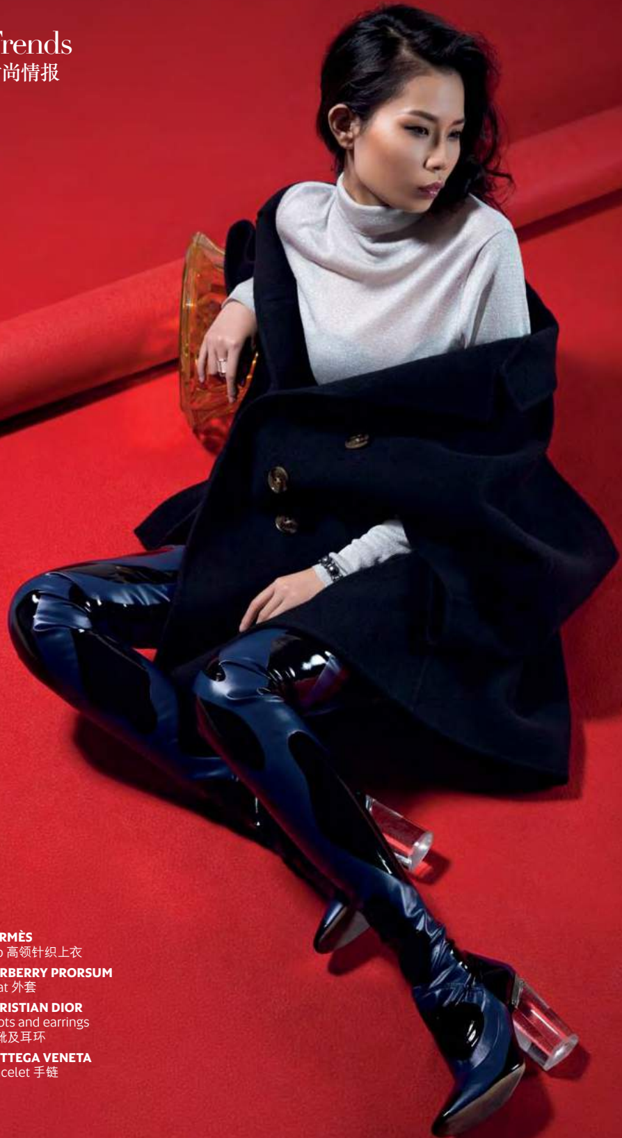
HERMÈS Top 高领针织上衣 BURBERRY PRORSUM Coat 外套 CHRISTIAN DIOR Boots and earrings 长靴及耳环 BOTTEGA VENETA Bracelet 手链