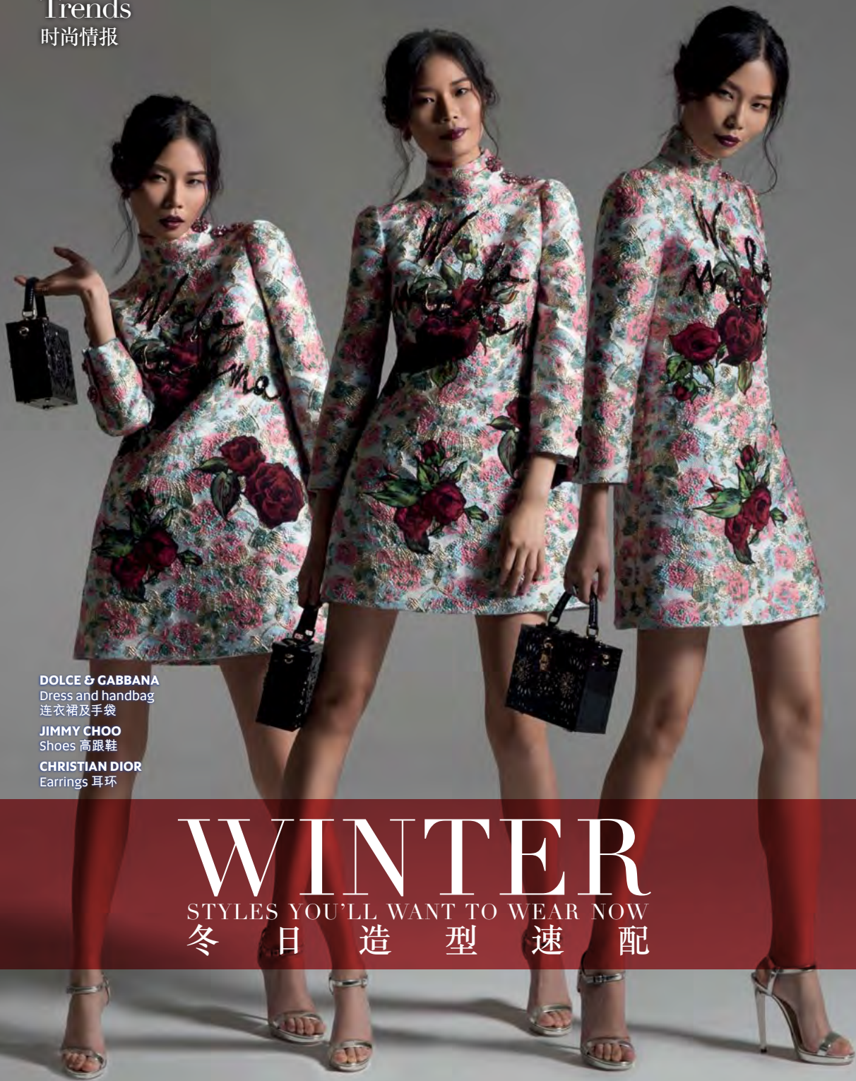
DOLCE & GABBANA Dress and handbag 连衣裙及手袋 JIMMY CHOO Shoes 高跟鞋 CHRISTIAN DIOR Earrings 耳环