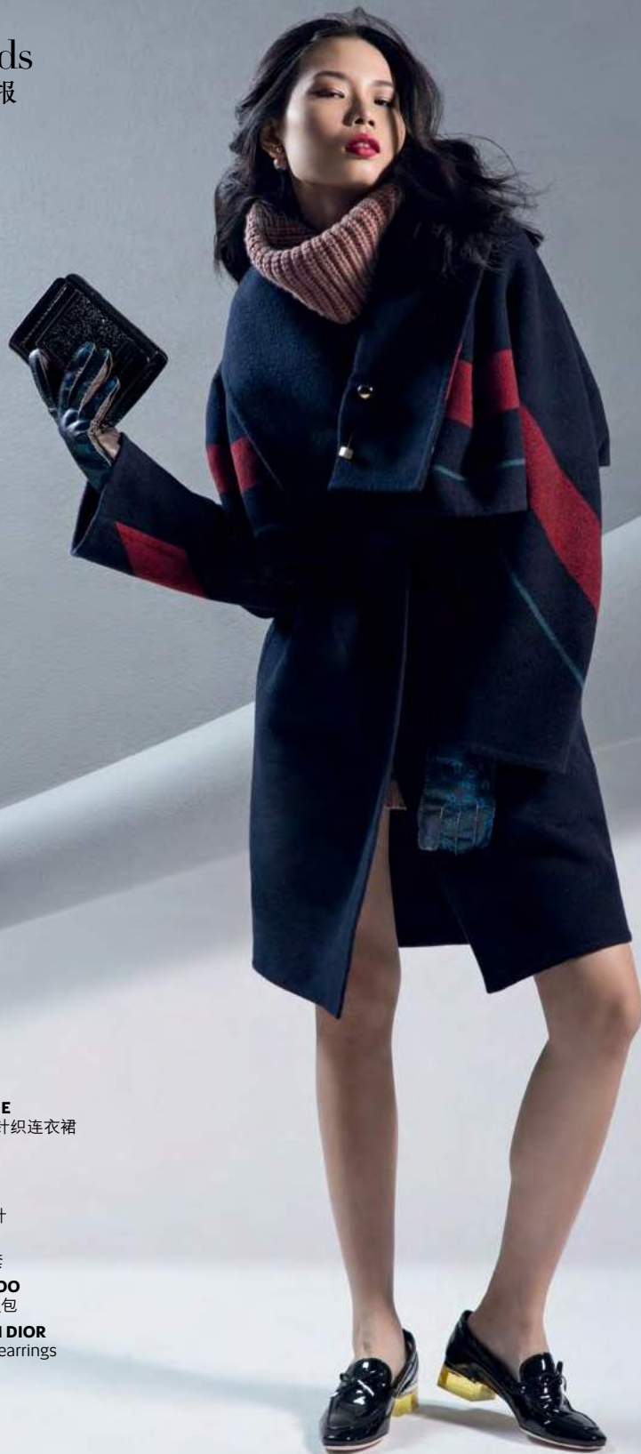
BLUMARINE Knit dress 针织连衣裙 HERMÈS Coat 外套 BALLY Brooch 胸针 PRADA Gloves 手套 JIMMY CHOO Clutch 手抓包 CHRISTIAN DIOR Shoes and earrings 皮鞋及耳环