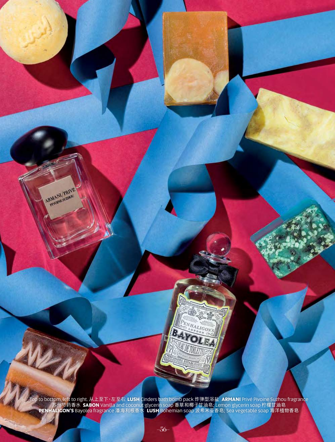
Top to bottom, left to right. 从上至下·左至右: LUSH Cinder bath bomb pack 炸弹型浴盐 ARMANI Privé Pivoine Suzhou fragrance 苏州芍药香水 SABON Vanilla and coconut glycerin soap 香草和椰子甘油皂; Lemon glycerin soap 柠檬甘油皂 PENHALIGON'S Bayolea fragrance 潘海利根香水 LUSH Bohemian soap 波希米亚香皂; Sea vegetable soap 海洋植物香皂