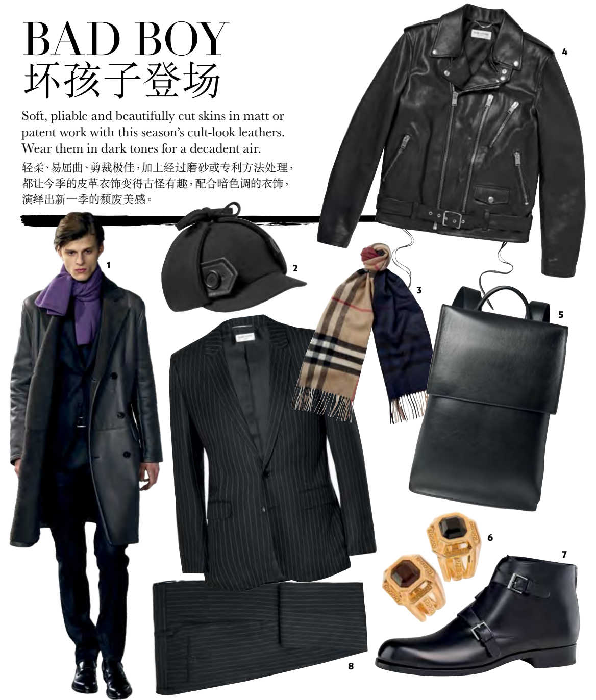
1. HERMÈS AW'15 runway look 秋冬T台造型 2. MIU MIU Couture cashmere hat 羊绒帽 3. BURBERRY Checked cashmere scarf 格子羊绒围巾 4. SAINT LAURENT Leather biker jacket 皮革机车夹克 5. BALenciAGA Phileas leather backpack 长方皮革背包 6. VERSACE Gem and gold rings 宝石金指环 7. SERGIO ROSSI Leather black glossy loafers 光面黑皮革便鞋 8. SAINT LAURENT Black slim-fit pinstripe wool suit 黑色修身细条纹羊毛西装

轻柔、易屈曲、剪裁极佳，加上经过磨砂或专利方法处理，都让今季的皮革衣饰变得古怪有趣，配合暗色调的衣饰，演绎出新一季的颓废美感。