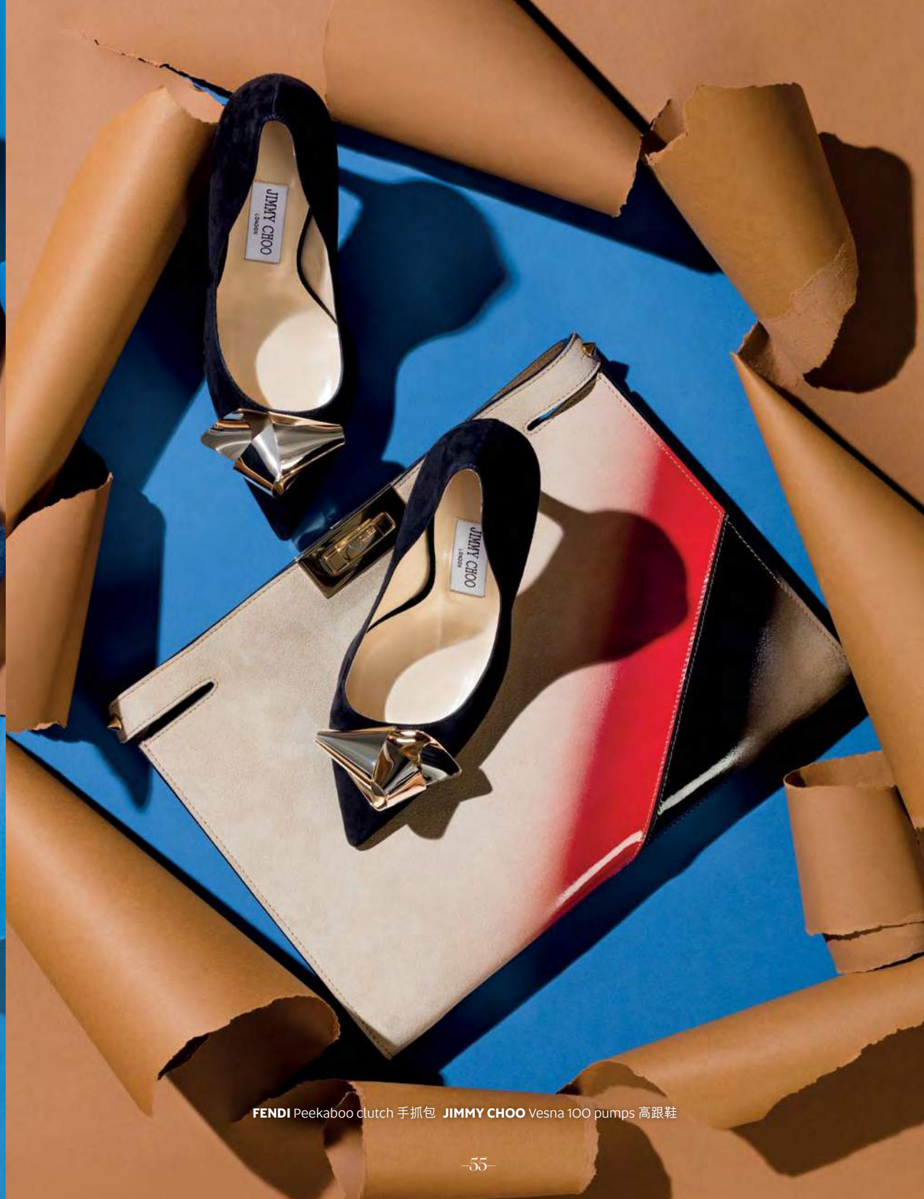
FENDI Peekaboo clutch 手抓包 JIMMY CHOO Vesna 100 pumps 高跟鞋