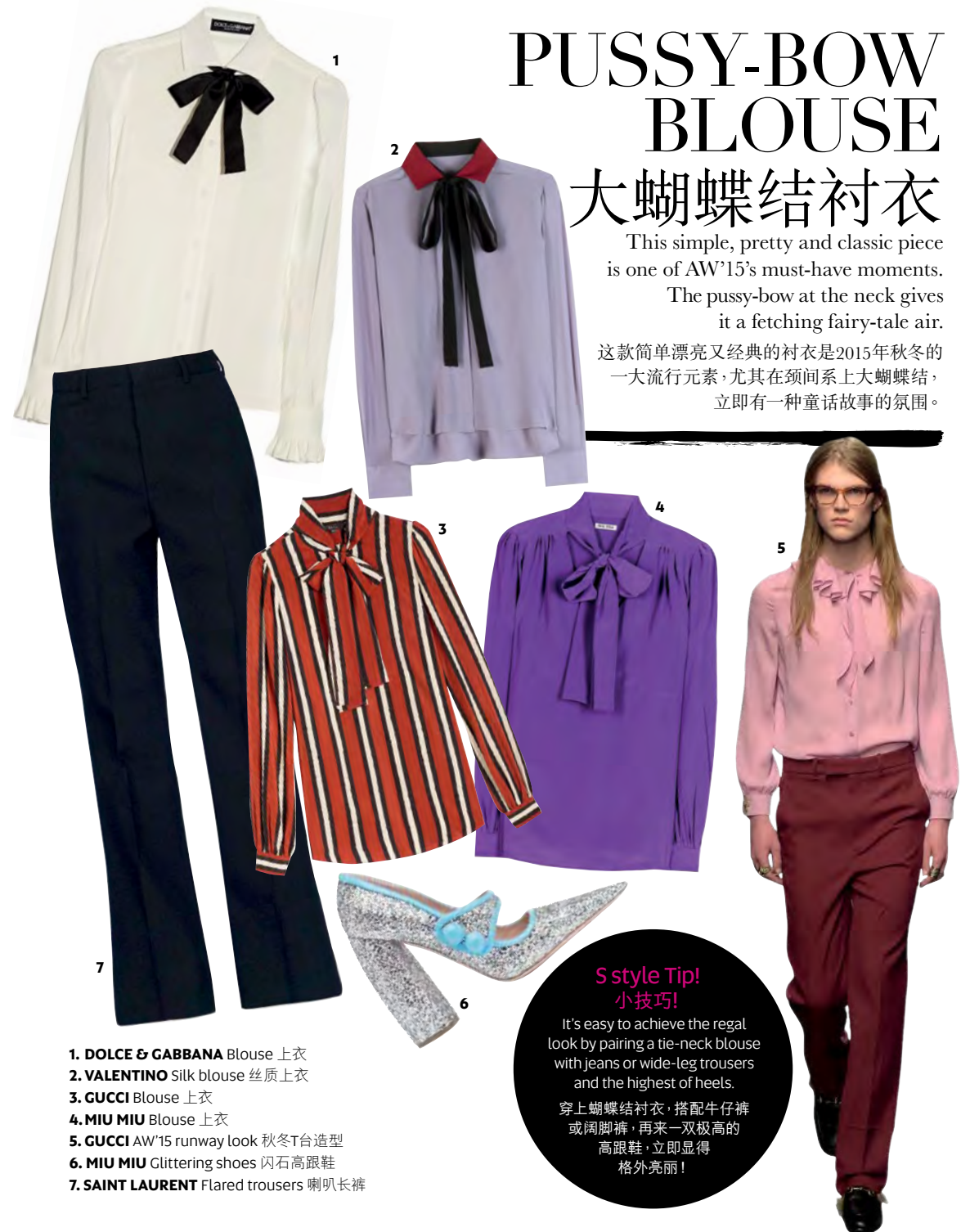
1. DOLCE & GABBANA Blouse 上衣 2. VALENTINO Silk blouse 丝质上衣 3. GUCCI Blouse 上衣 4. MIU MIU Blouse 上衣 5. GUCCI AW'15 runway look 秋冬T台造型 6. MIU MIU Glittering shoes 闪石高跟鞋 7. SAINT LAURENT Flared trousers 喇叭长裤

这款简单漂亮又经典的衬衣是2015年秋冬的一大流行元素,尤其在颈间系上大蝴蝶结,立即有一种童话故事的氛围。