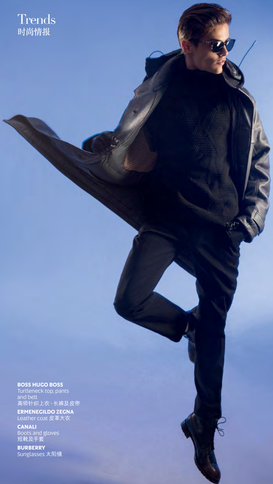
BOSS HUGO BOSS Turtleneck top, pants and belt 高领针织上衣、长裤及皮带 ERMENEGILDO ZEGNA Leather coat 皮革大衣 CANALI Boots and gloves 短靴及手套 BURBERRY Sunglasses 太阳镜