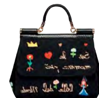
DOLCE & GABBANA Handbag 手提包