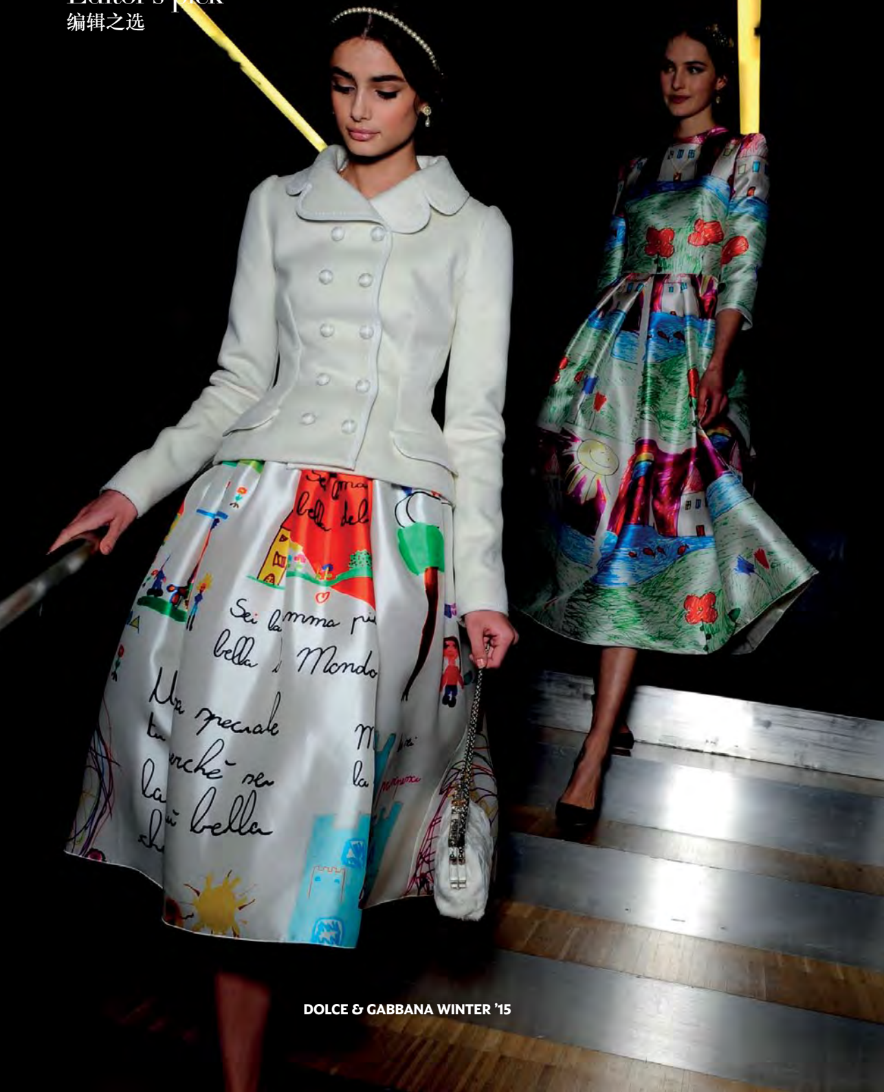
DOLCE & GABBANA WINTER '15