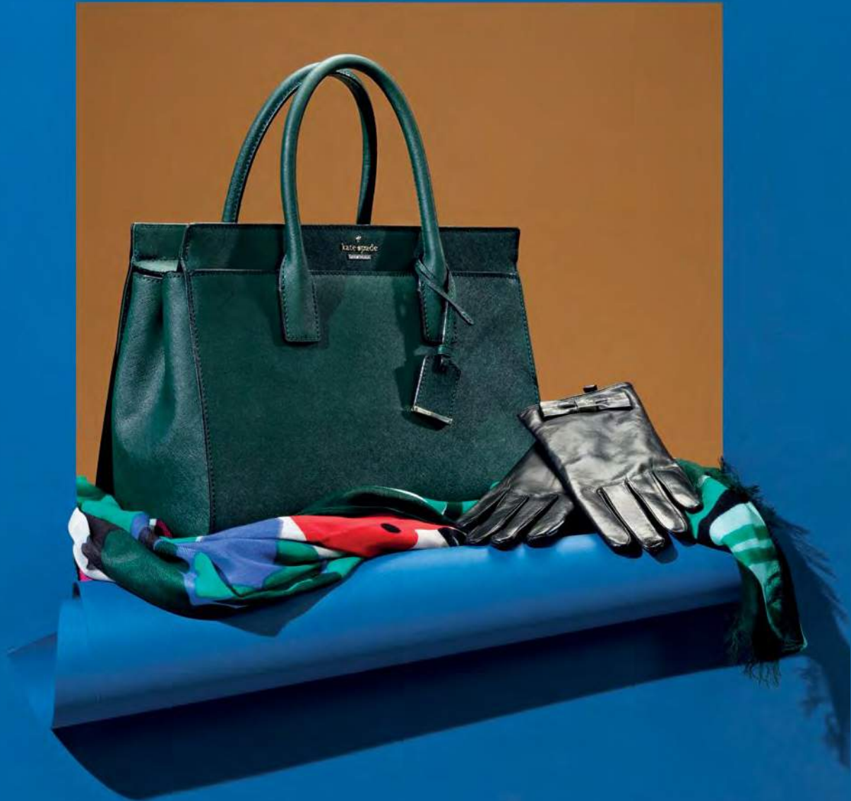
This page 本页: KATE SPADE Cameron Street Candace satchel, Leather Block Colour Bow Gloves and Print Scarf 手提包、黑蝴蝶结皮革手套及印花领巾