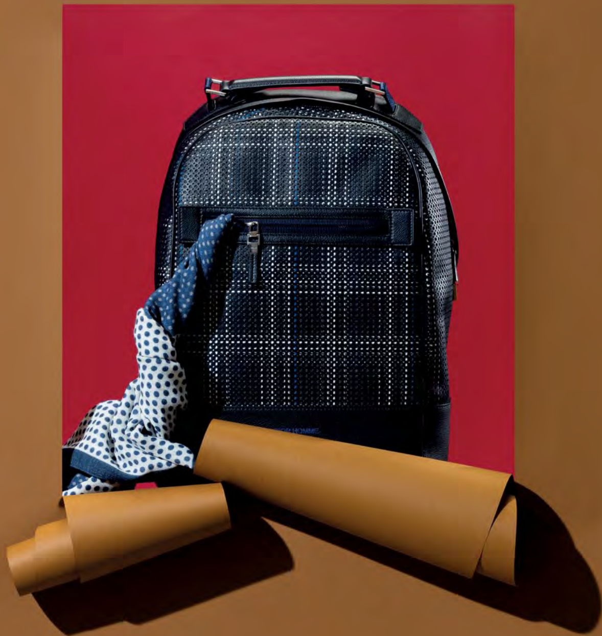
This page 本页: DIOR HOMME Black and blue leather canvas backpack 黑蓝皮革与帆布背包 SCOTCH & SODA Dot print scarf 圆点领巾