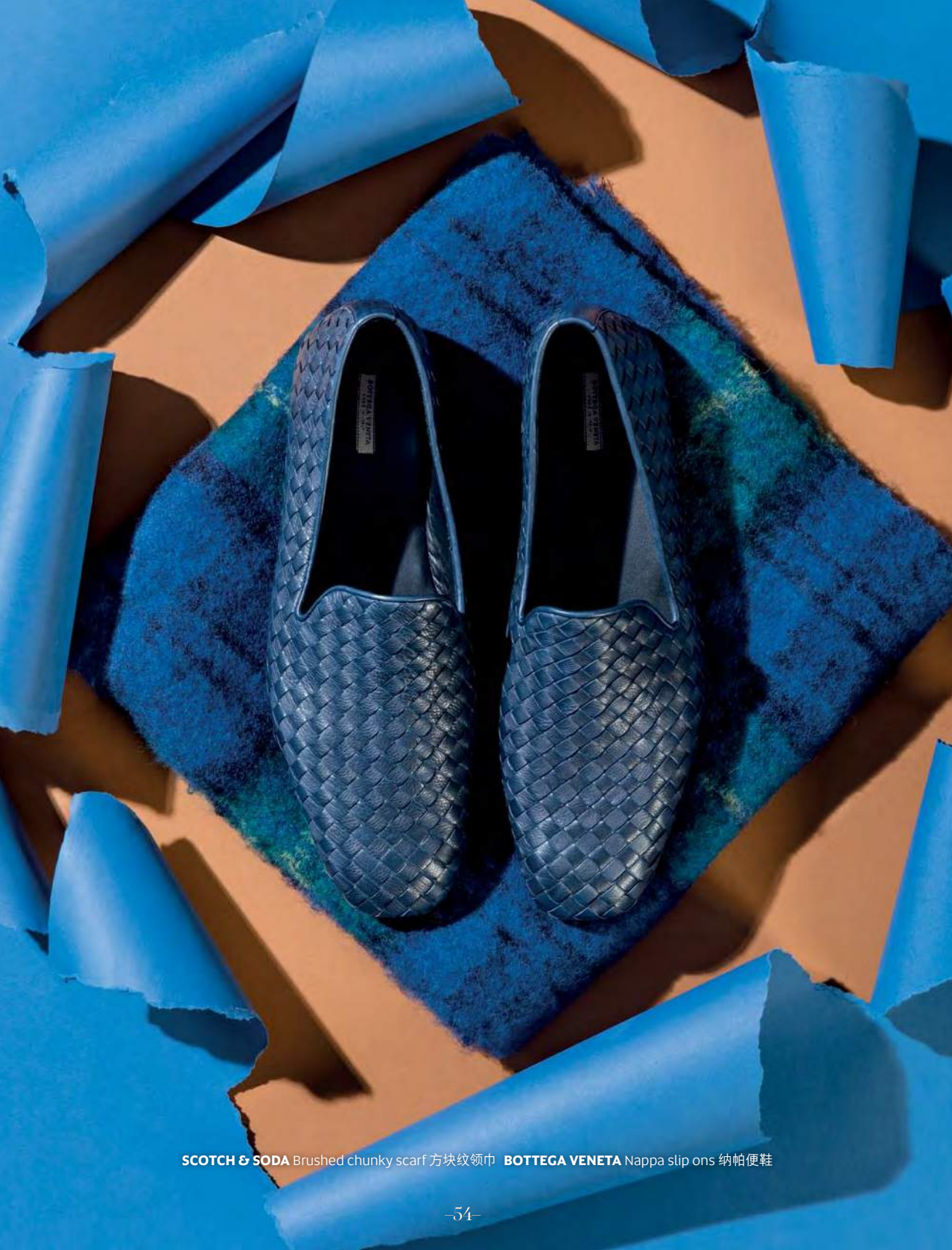
SCOTCH & SODA Brushed chunky scarf 方块纹领巾 BOTTEGA VENETA Nappa slip ons 纳帕便鞋