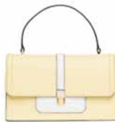
MIU MIU 缪缪 Bag 手提包

多得缪缪等品牌在T台上推波助澜，加上粉色搭配和金铰链等细节，重新演绎六十年代的方形手提包，让这经典设计再次成为本季的火红热选。这包包能搭配不同个性女士，同时表达她们站在今季潮流之巅的地位。不妨配衬色彩强烈的高跟鞋。