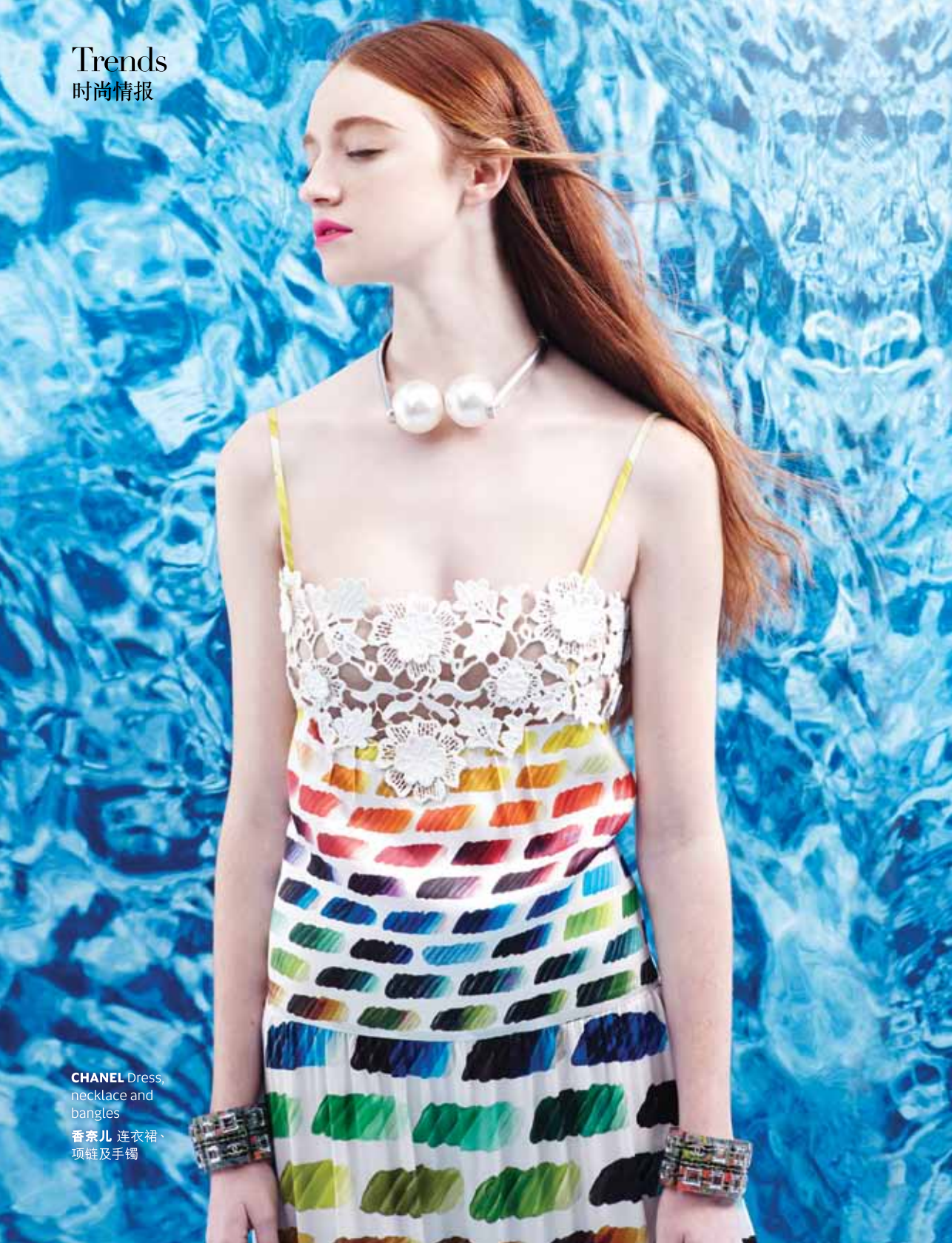
CHANEL Dress, necklace and bangles 香奈儿 连衣裙、 项链及手镯