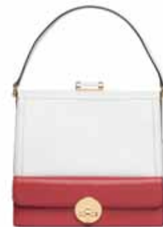
MIU MIU 缪缪 Bag 手提包