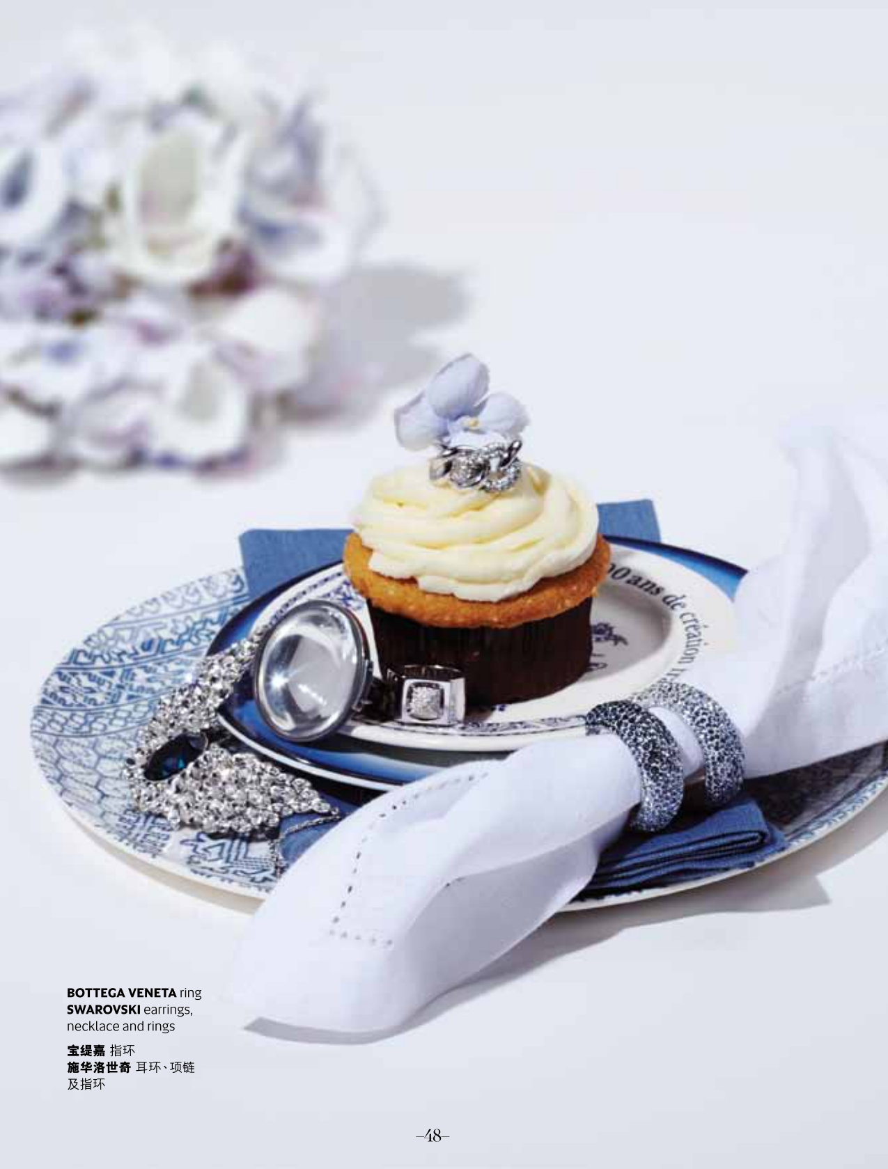
BOTTEGA VENETA ring SWAROVSKI earrings, necklace and rings