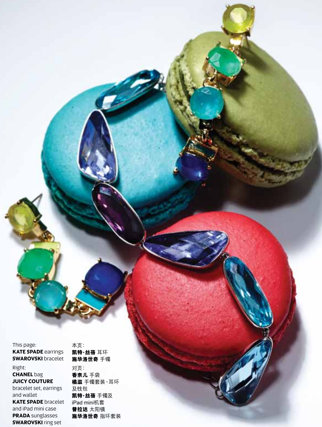
This page: KATE SPADE earrings SWAROVSKI bracelet Right: CHANEL bag JUICY COUTURE bracelet set, earrings and wallet KATE SPADE bracelet and iPad mini case PRADA sunglasses SWAROVSKI ring set