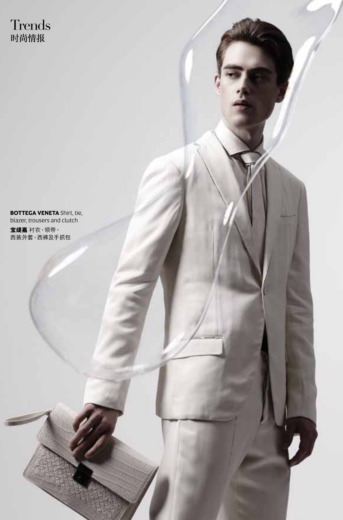
BOTTEGA VENETA Shirt, tie, blazer, trousers and clutch 宝缇嘉 衬衣、领带、西装外套、西裤及手抓包