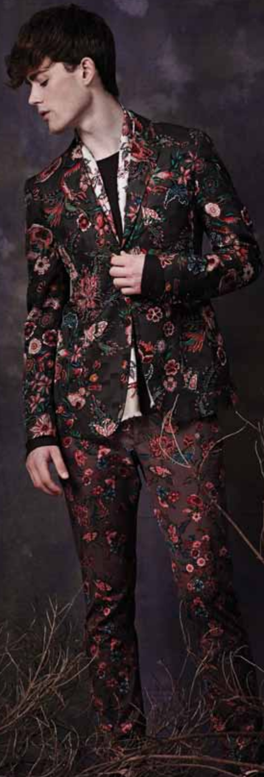
GUCCI Top, blazer, scarf and trousers BOTTEGA VENETA Shoes 古驰 上衣、西装外套、 领巾及西裤 宝缇嘉 皮鞋