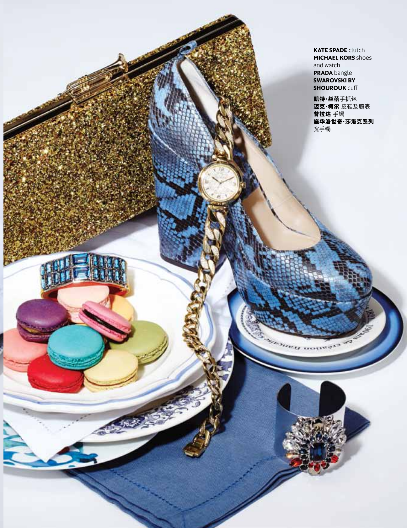
KATE SPADE clutch MICHAEL KORS shoes and watch PRADA bangle SWAROVSKI BY SHOUROUK cuff

凯特·丝蓓手抓包 迈克·柯尔 皮鞋及腕表 普拉达 手镯 施华洛世奇·莎洛克系列 宽手镯