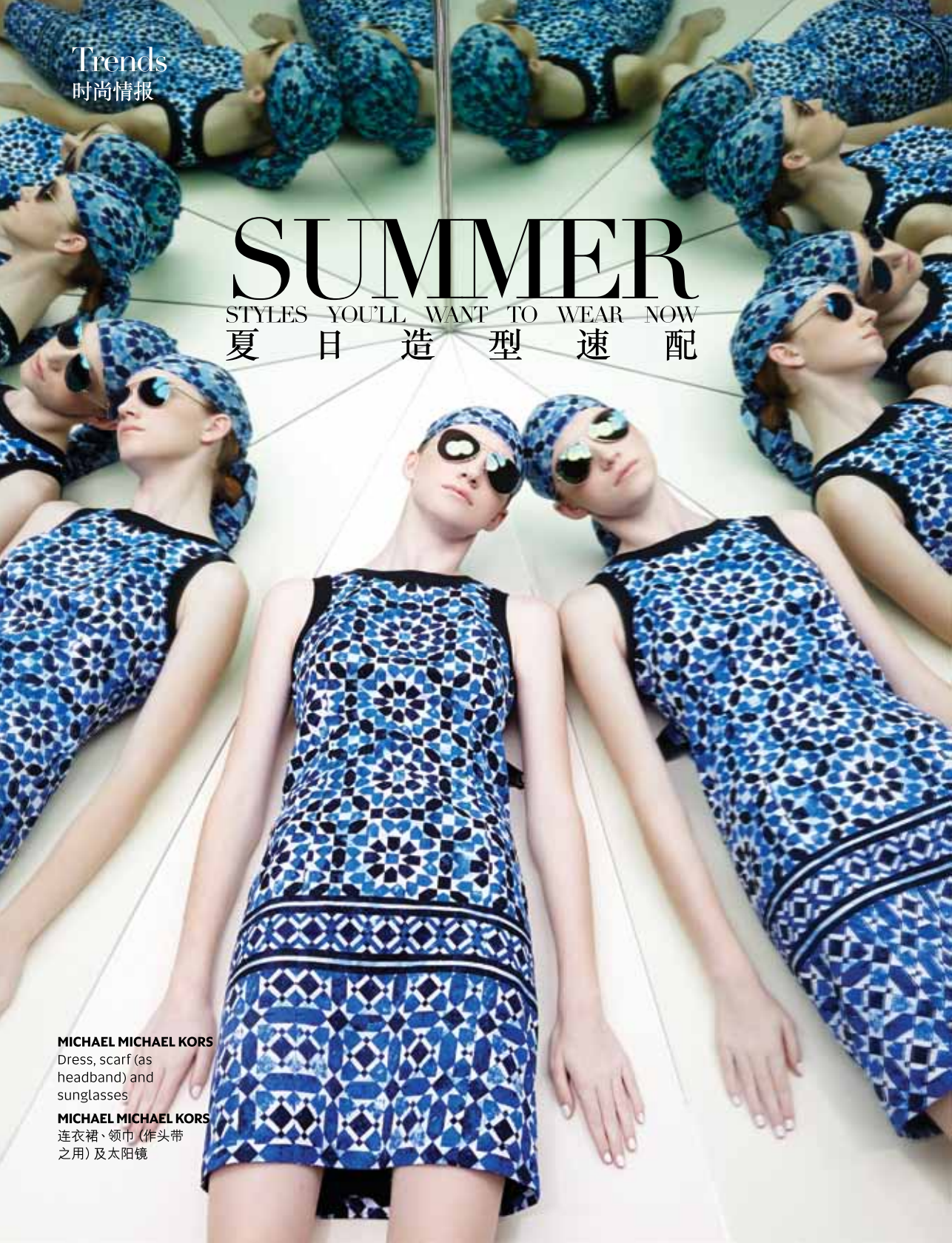
MICHAEL MICHAEL KORS Dress, scarf (as headband) and sunglasses