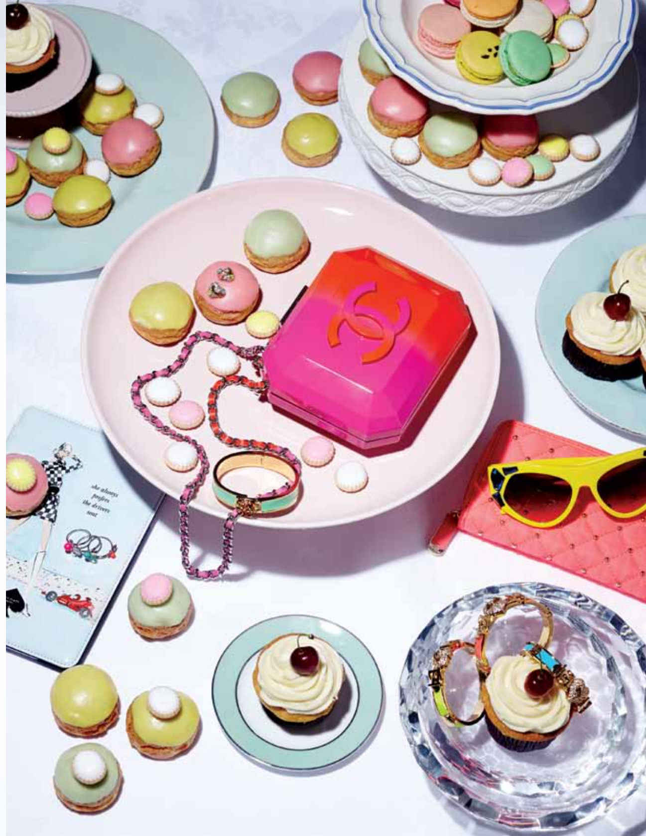
本页: 凯特·丝蓓 耳环 施华洛世奇 手镯 对页: 香奈儿 手袋 橘滋 手镯套装·耳环 及钱包 凯特·丝蓓 手镯及 iPad mini机套 普拉达 太阳镜 施华洛世奇 指环套装