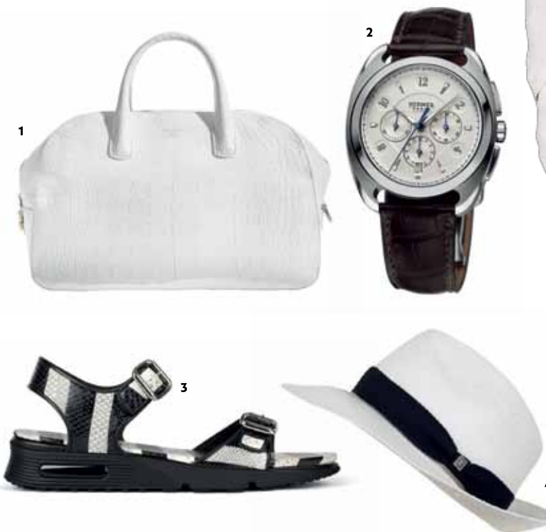
1. GIORGIO ARMANI Leather bag 2. HERMÈS Leather-band watch 3. GIVENCHY Two-tone sandals 4. MASSIMO DUTTI Black-band hat 5. GIORGIO ARMANI SS14 runway look 1. 乔治·阿玛尼 真皮手提包 2. 爱马仕 皮带计时腕表 3. 纪梵希 两色凉鞋 4. 玛西莫·都蒂 白帽子 5. 乔治·阿玛尼 2014年春夏季T台造型