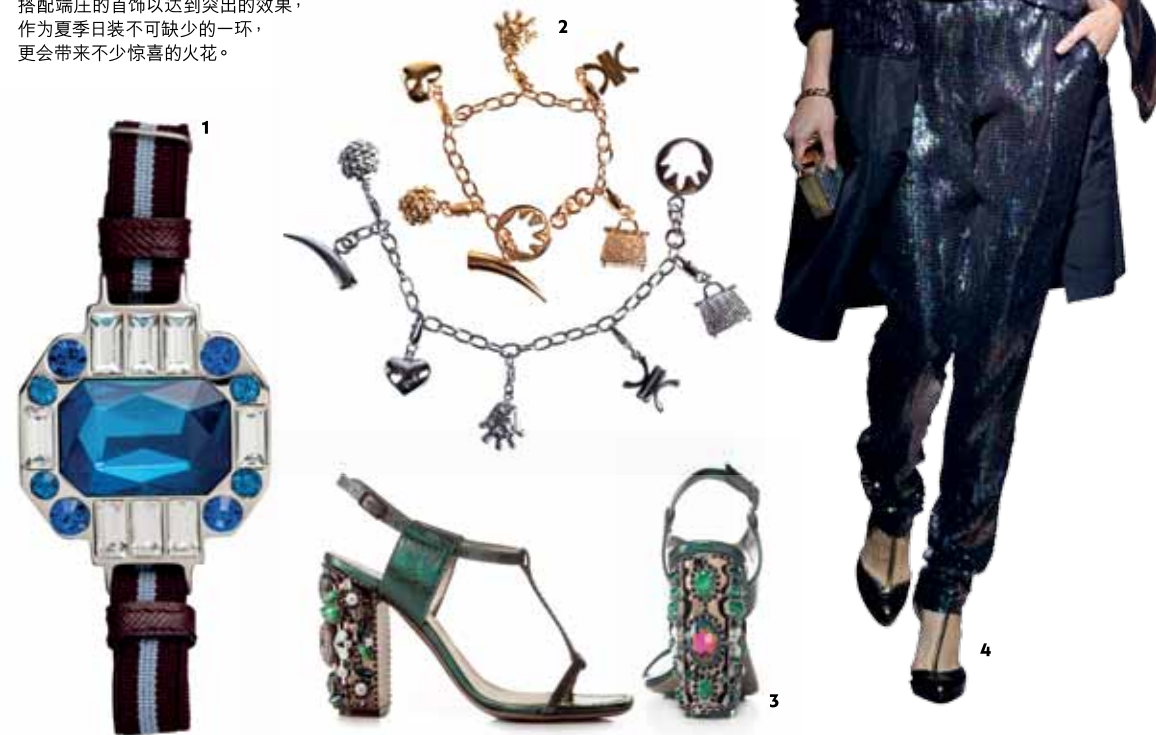
1. PRADA Jewelled belt 2. KWANPEN Gold and silver bracelet 3. LANVIN Green jeweled sandals 4. LANVIN SS14 runway look 1. 普拉达 宝石腰带 2. KWANPEN 金、银手链 3. 浪凡 绿色宝石高跟凉鞋 4. 浪凡 2014年春夏季T台造型

搭配端庄的首饰以达到突出的效果，作为夏季日装不可缺少的一环，更会带来不少惊喜的火花。