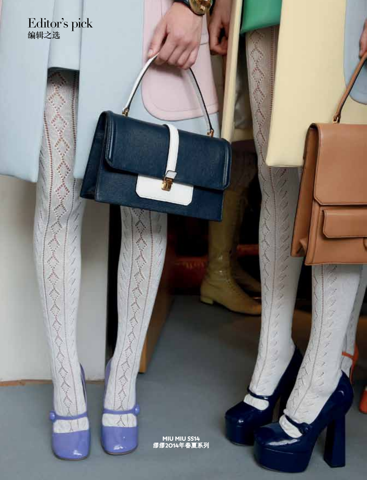
MIU MIU SS14 缪缪2014年春夏系列