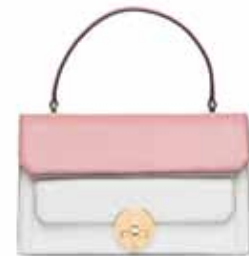
MIU MIU 缪缪 Bag 手提包