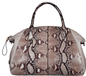
TOD'S 托德斯 Handbag 手袋