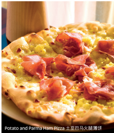
Potato and Parma Ham Pizza 土豆巴马火腿薄饼

“这里创造的菜式具有浓厚的乡村风味，不得不让人回想到梦里的故乡和曾经的快乐童年。在这里不会感觉到过于拘谨，大可以随心所欲享受美食。”行政副总厨贾雪雯这样向我们介绍这家位于澳门的家乡风味意大利餐厅——班妮，“当人们来到一家远离本土的意大利餐厅时，他们期望去了解这种独具风味的菜式并且去学习如何品尝。对于我而言，保持菜式的纯正和原味是最重要的。意大利菜已经渗透于我的血液，她是我所学所想。”