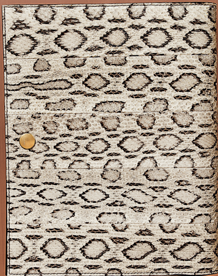
CÉLINE 赛琳 Clutch 手包