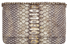
CHANEL 香奈儿 Clutch 手包

蛇年已经到来，何不在衣橱中添置一抹引人注目的蟒蛇纹理呢，它必将成为今年最具代表的流行元素。觉得难以驾驭？大可不必担心。蟒蛇纹理与剪裁简单且优雅的裙子、手袋或者鞋履的搭配可谓是天衣无缝。脚蹬华伦天奴的蟒蛇纹理高跟鞋，身著凸显骨感的连衣裙；抑或身穿最简单的白色T恤与牛仔裤，搭配一款来自赛琳或者托德斯的蛇皮手包或者手袋，轻而易举便造就了乾淨利落又不失性感的蛇年新造型！