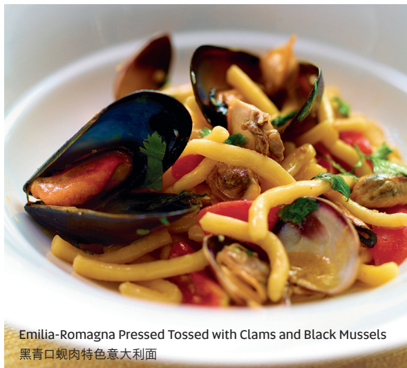
Emilia-Romagna Pressed Tossed with Clams and Black Mussels 黑青口蜆肉特色意大利面